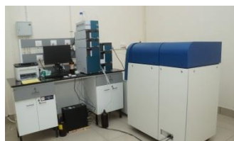
Liquid Chromatography- (JSM-7610F Plus JEOL) Spectrometer (LC-MS/MS QTOF) (Triple TOF 5600 + , AB SCIEX)