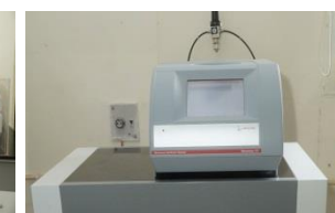
Microwave Synthesizer (Monowave 200, Anton Paar)

The CIL cater to the needs of the students, research scholar and teachers of this university as well as other educational institute and industry in order to promote research activities.