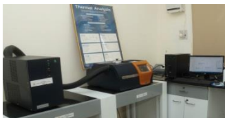
Differential Scanning Calorimeter (DSC 25) TA Instruments