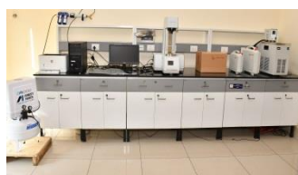
Research Grade Advance Rheometer System (MCR 302e Anton Paar)